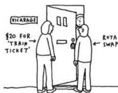
ANSWERING THE DOOR AT ALL HOURS AND FOR VARIOUS REASONS