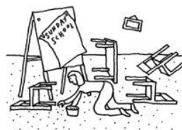
PICKING UP PIECES OF GLITTER ONE BY ONE