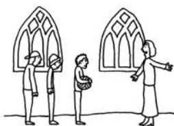
ENCOURAGING YOUNG PEOPLE TO FIND A DIFFERENT WALL TO KICK A FOOTBALL AGAINST