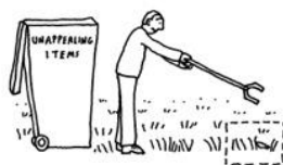
KEY AREA OF DIAGRAM LEFT DELIBERATELY VAGUE DISPOSING OF THINGS DISCOVERED IN THE CHURCHYARD