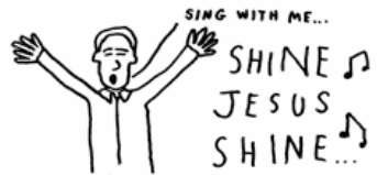
SOME ODD OR UNPREDICTABLE BEHAVIOUR