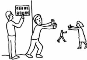
TURNING OUT THE LIGHTS