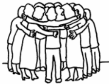
THE COMMENCEMENT OF A GROUP HUG