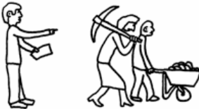
ORGANISING A WORK PARTY