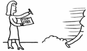
APPROACHING PEOPLE WITH A ROTA