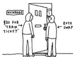
ANSWERING THE DOOR AT ALL HOURS AND FOR VARIOUS REASONS