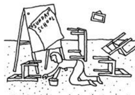
PICKING UP PIECES OF GLITTER ONE BY ONE