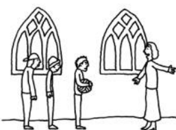
ENCOURAGING YOUNG PEOPLE TO FIND A DIFFERENT WALL TO KICK A FOOTBALL AGAINST