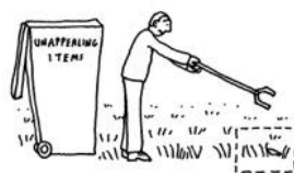
DISPOSING OF THINGS DISCOVERED IN THE CHURCHYARD