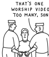
LIVE ARREST OWING TO IGNORING COPYRIGHT