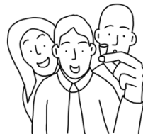
INVASION BY ROWDY GROUP OF METHODISTS