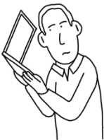
PROBLEMS WITH THE SOUND