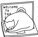
ANIMALS RUNNING AMOK