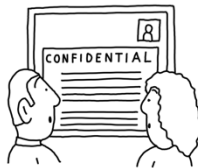
ACCIDENTAL SCREEN-SHARING OF PASTORALLY-SENSITIVE INFORMATION